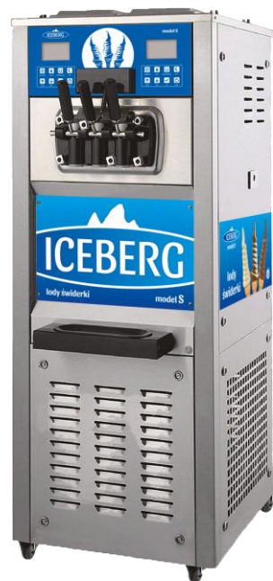
EASY-TO-USE CONTROL PANEL